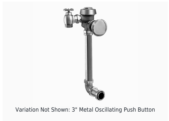
Variation Not Shown: 3" Metal Oscillating Push Button